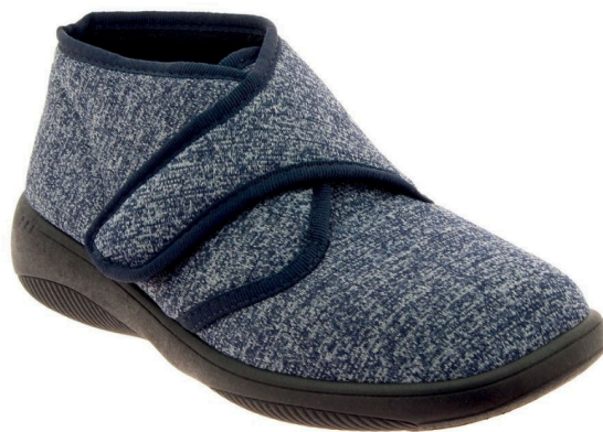
Example of closed slippers